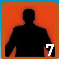
POWERFUL KEYNOTE PRESENTATIONS