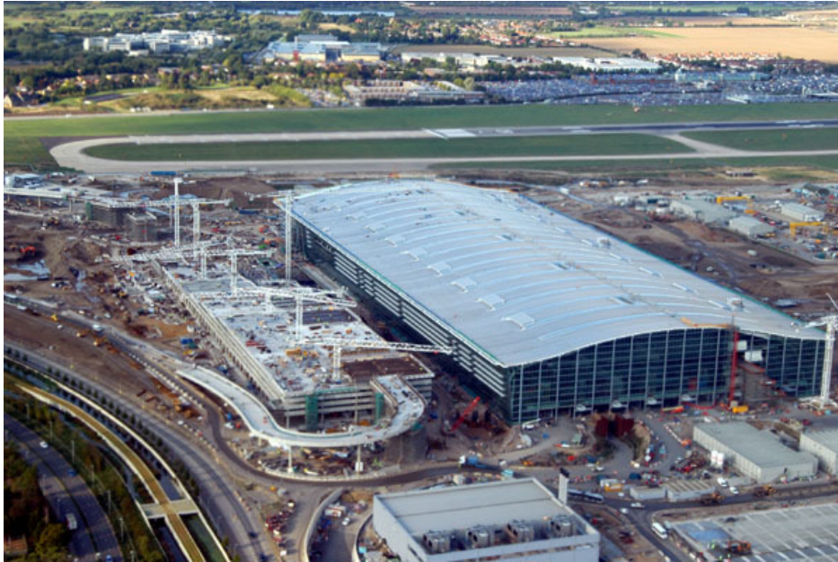
Figure 2 – T5 under construction, September 2005

At £4.3 billion, T5 was the biggest construction project in Europe (Figure 2), yet it appears to have run like clockwork, completed on schedule and 'under budget'. Its success is attributed to the commitment made by the client, BAA Limited (BAA), to an entirely different way of working focused on proactive collaboration with its contractors.