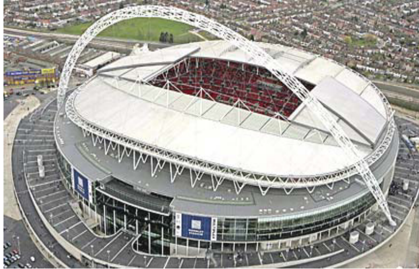
Figure 1 – The completed stadium

Australian builder Multiplex won the ‘Guaranteed Maximum Price’ (GMP) contract to design and construct a new, world-class 90,000 seat Wembley football stadium. Work commenced in September, 2002, with completion planned well ahead of the FA Cup Final in May 2006. The stadium was eventually finished just in time for the 2007 FA Cup Final.